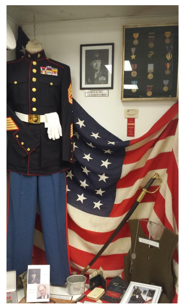
George Nelson display

If you haven't yet sent in your 2015 membership dues, please do so now. Remember that the museum depends on dues and donations.