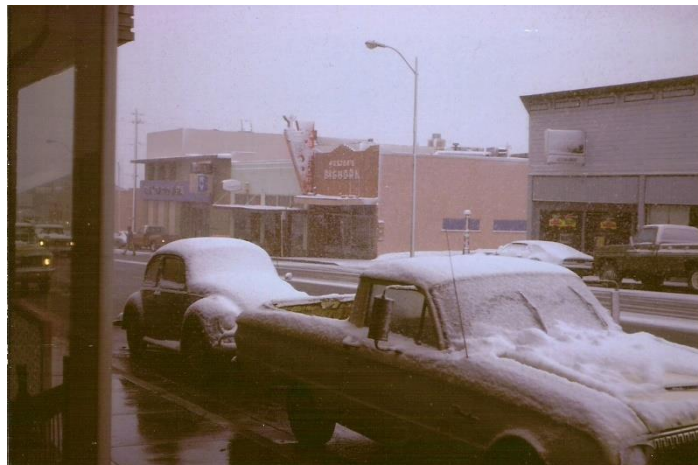
Rio Vista Main Street, 1976

It is the middle of January, and the temperature is expected to reach 64°F today. Longtime residents might remember those rare times when snow actually accumulated on the streets of Rio Vista. If you have pictures of snow in Rio Vista, we would love to scan them for our collection.