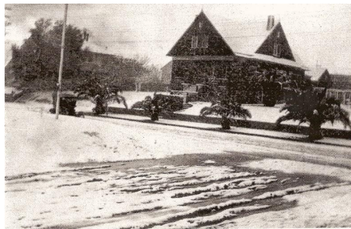
Dr. A. J. McKinnon Home, 1917