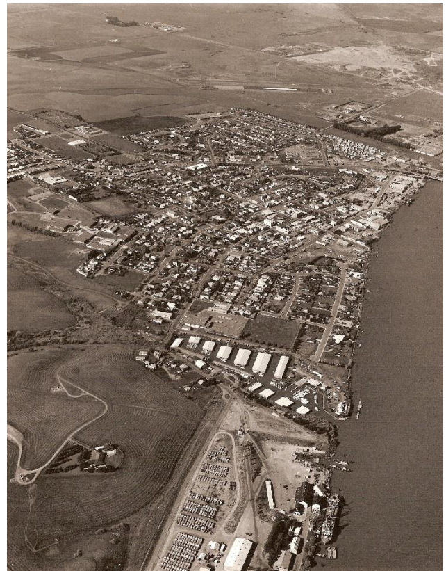
Aerial photo of Rio Vista, 1972

We hope to see many of you at next January's meeting.